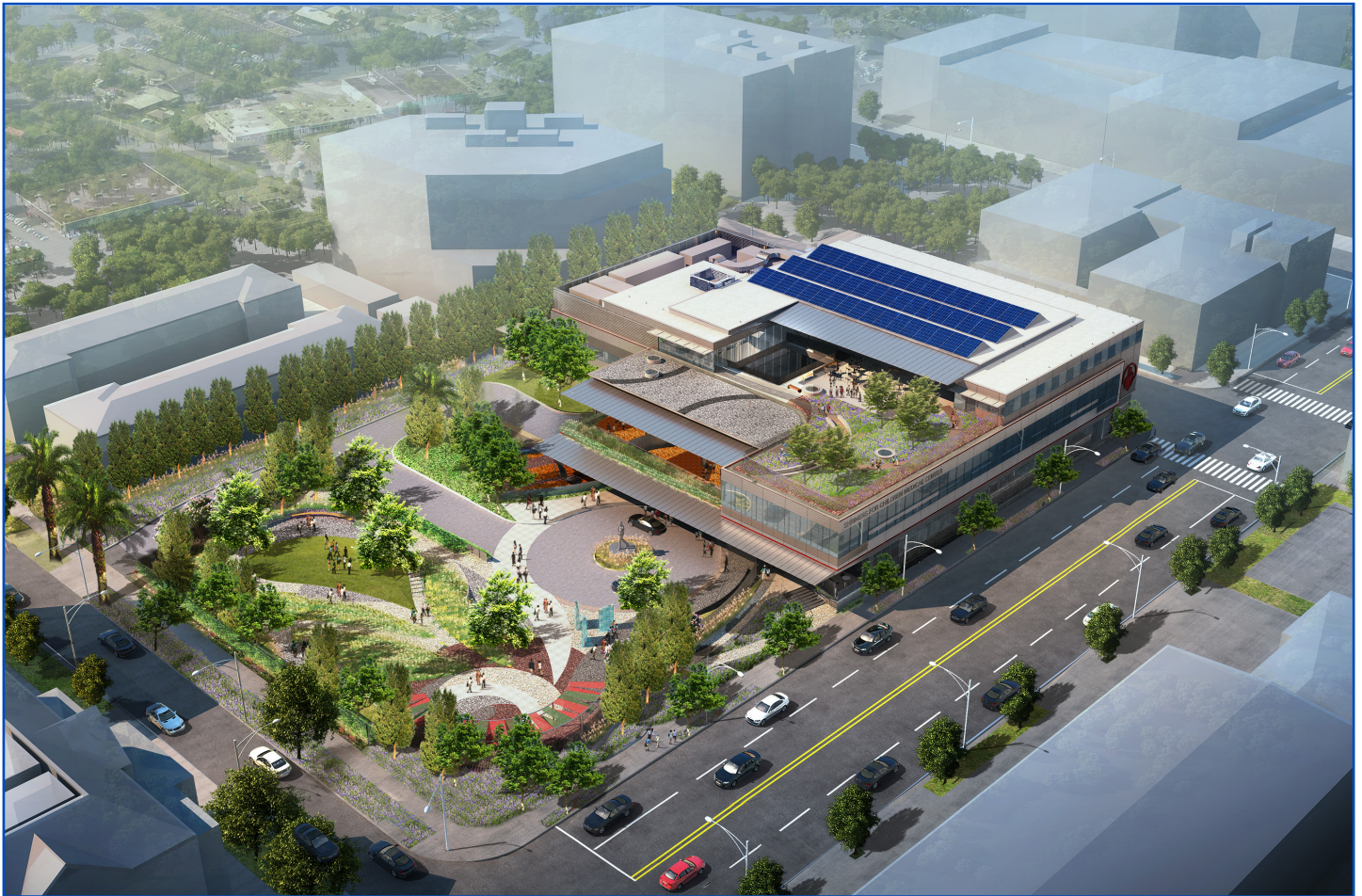
Shriners For Children Medical Center Pasadena California Dedication April 13, 2017