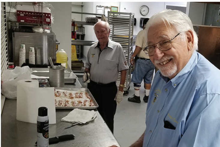
Real Men can Cook