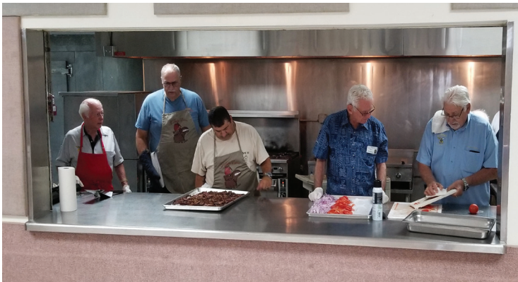
Past Potentates Breakfast