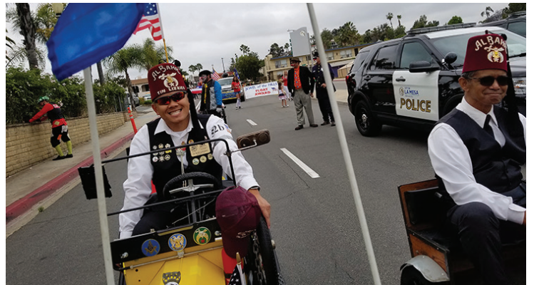
Al Bahr on parade