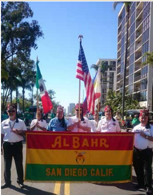
Legion of Honor Color Guard

DEADLINE FOR THE JANUARY ISSUE IS DECEMBER 6 TH