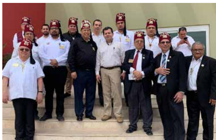
Sinaloa Visitation, March 2019