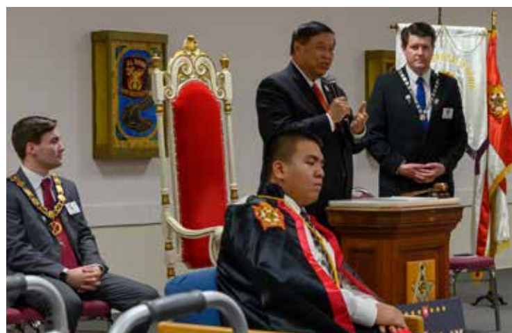
SCJ Demolay Degree San Diego at Al Bahr Shriner